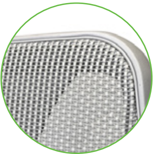
Gray mesh and frame

Both the tCentric Hybrid seat and backrest are made from elastomeric mesh with fill yarns made from polyester allowing air, body heat and water vapor to pass through. When stretched, this material yields excellent load-bearing properties and resiliency, showing less than 5% load-bearing loss when tested according to BIFMA standards.