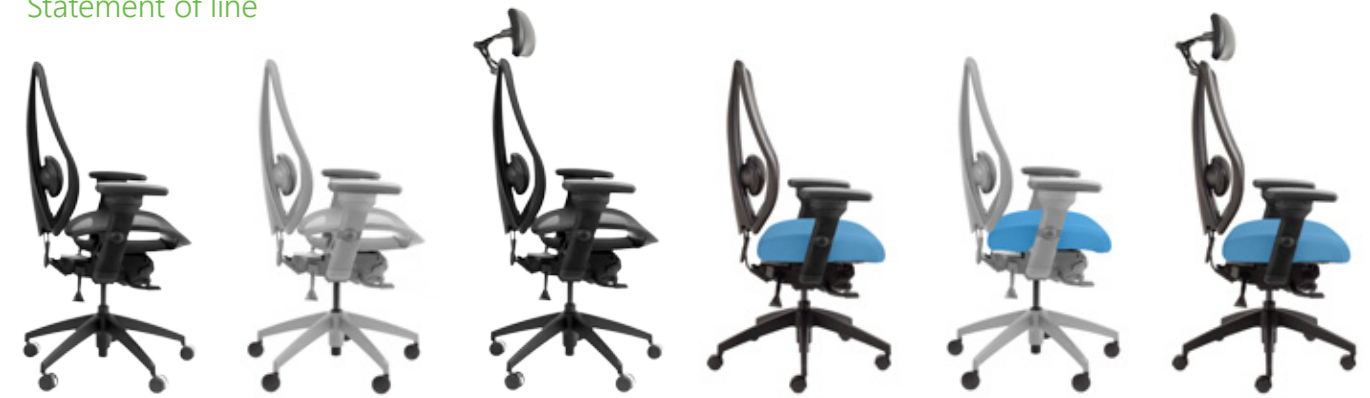
tCentric Hybrid All Mesh Black tCentric Hybrid All Mesh Gray tCentric Hybrid All Mesh Black Adjustable headrest tCentric Hybrid Upholstered Seat Black tCentric Hybrid Upholstered Seat Gray tCentric Hybrid Upholstered Seat Black Adjustable Headrest