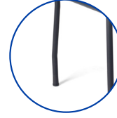
Kick back legs for added stability