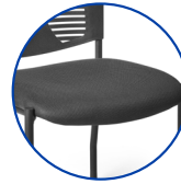
Dual curve waterfall seat