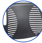
Dual curve backrest with airflow technology