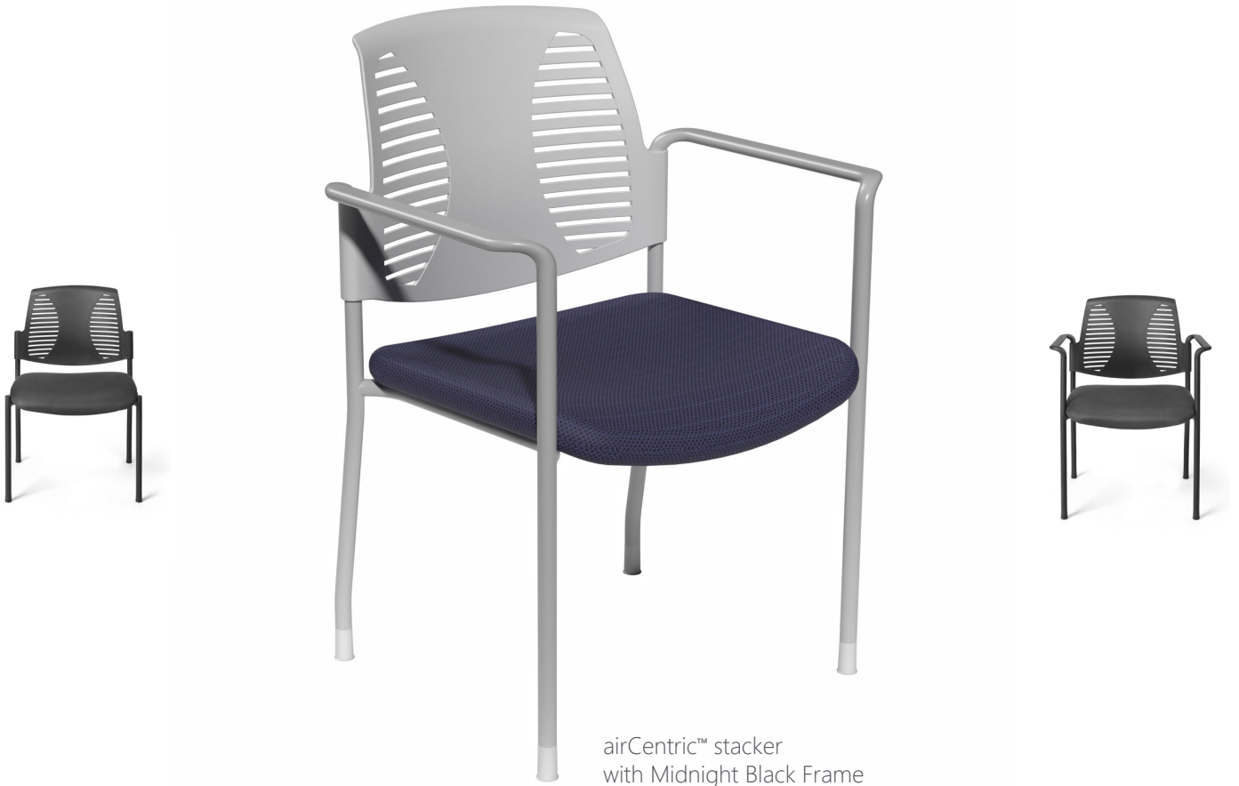
airCentric™ stacker with Midnight Black Frame

The airCentric™ stacker chair provides a modern aesthetic with a unique airflow backrest complementing the design of the airCentric 2 ergonomic task chair.