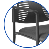
With or without arms