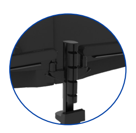
Post System for Scalability and Modularity