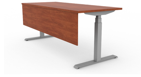
Modesty Panel Thermally Fused Laminate

Modesty Panels and Modesty+Privacy Panels are front mounted panels for fixed height and height adjustable work stations. They provide visual privacy and are aesthetically pleasing. Thermally Fused Laminates are stylish and easy to clean and disinfect, and can perfectly match tabletop finish. Decorative Acoustic Panels are sturdy and tackable, effectively reducing the noise level. Various heights and widths options accommodate a wide variety of table sizes.