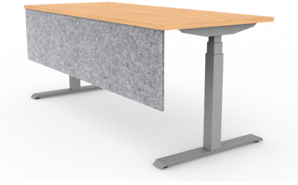
Modesty Panel Decorative Acoustic Panels