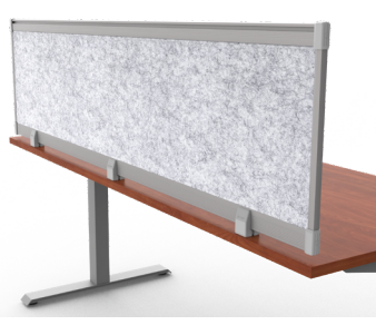
Framed Decorative Acoustical Privacy Panel