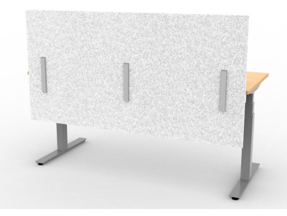
Modesty+Privacy Panel Decorative Acoustic Panels