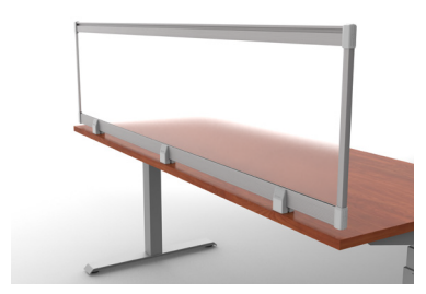
Framed Clear or Frosted Acrylic Privacy Panel