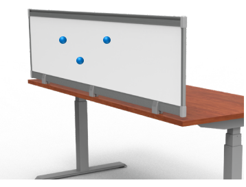
Framed Whiteboard or Magnetic Whiteboard Privacy Panel