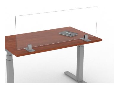
Clear Acrylic Privacy Panel with optional free standing foot bracket