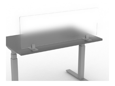
Frosted Acrylic Privacy Panel with optional free standing foot bracket

Non-framed and Framed Privacy Panels are surface mounted panels for fixed height and height adjustable work stations. Privacy Panels are visually appealing and sturdy. Multiple panel materials are available and offer benefits such as improved acoustics, aesthetics, and physical and visual separation, as well as functional capabilities (tac board, white board, magnet board). Various heights and widths options accommodate a wide variety of table sizes.