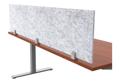
Decorative Acoustical Privacy Panel