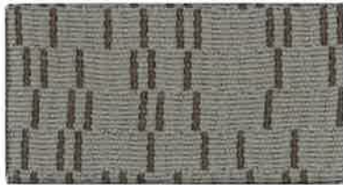
1304 Silver Lining